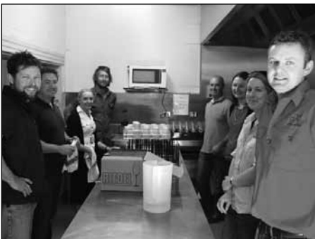
Stewards Left to Right: